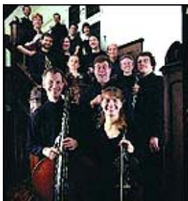
The Aradia Baroque Orchestra